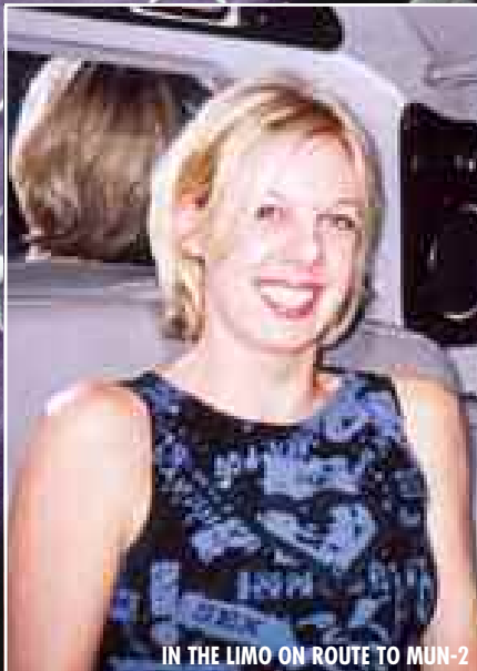
IN THE LIMO ON ROUTE TO MUN-2